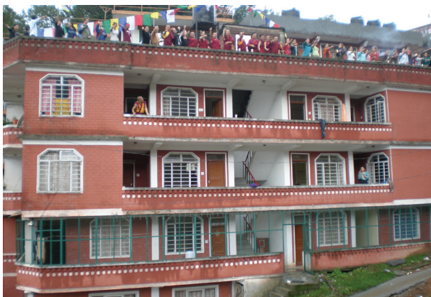
The new Lha Service Center and community kitchen, located below the main temple. The Lha Office is in downtown McLeod Ganj on Temple Road.

• Expand and improve our programs, such as the Community Soup Kitchen • Support Tibetan refugees with educational and health services, as well as the skills and assistance needed to build a new life in exile • Create awareness about the Tibetan refugee situation and preserve the endangered Tibetan culture